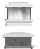
SOLAR / LED