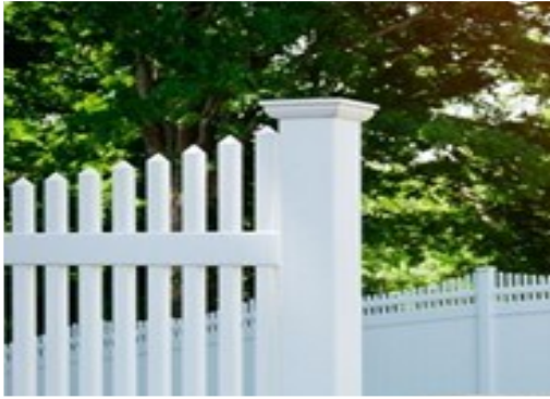
VICTORIAN BACK YARD privacy with picket front yard combination