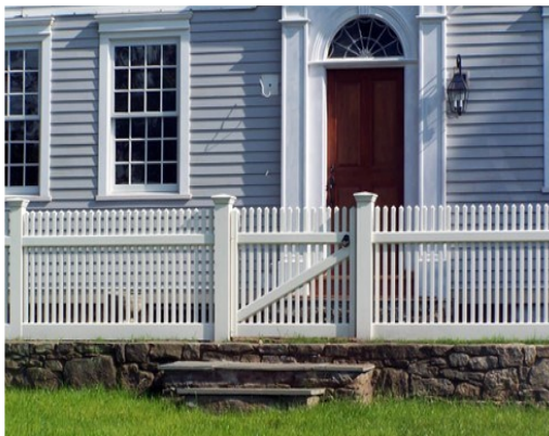
WHITE VINYL VICTORIAN PICKET along and on top of step up 2.0' wall