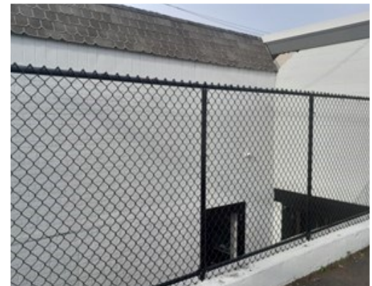
BLACK COMMERCIAL CHAINLINK for safety against drop off a top 1.0' retaining wall