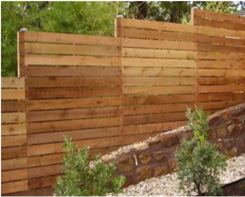
STEPPED WOOD ALONG RETAINING WALL in cedar with 4" x 4" posts

A Fairfield County favorite, wall top (wall topper) fence is one of the more prolific designs seen in the surrounding area. Whether combined with a rock wall build, installed anew on an existing wall, or replacing a current wall top with new materials, our experienced team of masons and fence installers establish clean, level lines in all kinds of rock or cement landscape or retaining walls. A full array of materials and designs are available to match the unique style of homes.