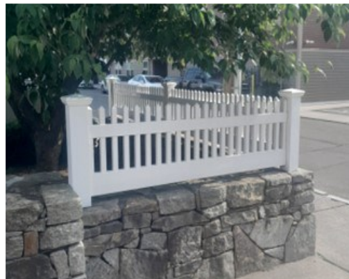
WHITE VINYL VICTORIAN WALL TOPPER sized at 2.0' H on top of 4.0' driveway entrance wall