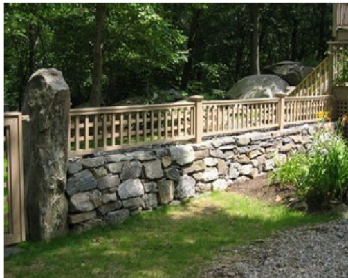
OLD ENGLISH LATTICE TOPPER atop loose mortared stone wall