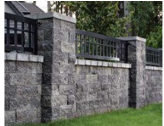
CUSTOM WROUGHT IRON between blocked pillars and bluestone caps