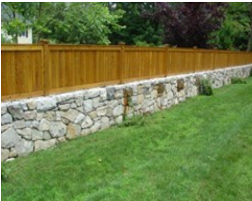
4.0' H TONGUE AND GROOVE CEDAR along 4.0' H landscape wall