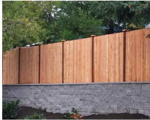
6.0' H TONGUE AND GROOVE CEDAR atop blocked retaining wall