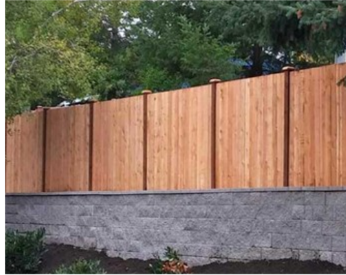
6.0' H TONGUE AND GROOVE CEDAR atop blocked retaining wall