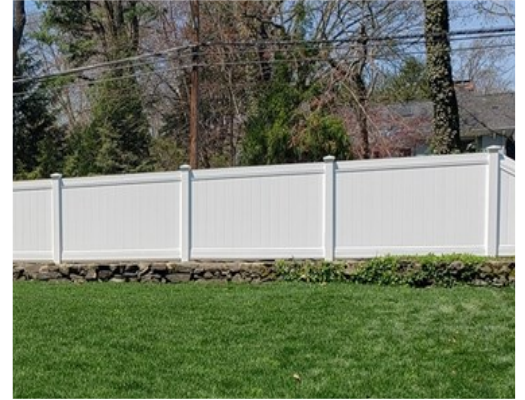
4.0' H WHITE VINLY PRIVACY along short landscape wall